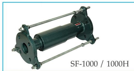
SF-1000 / 1000H